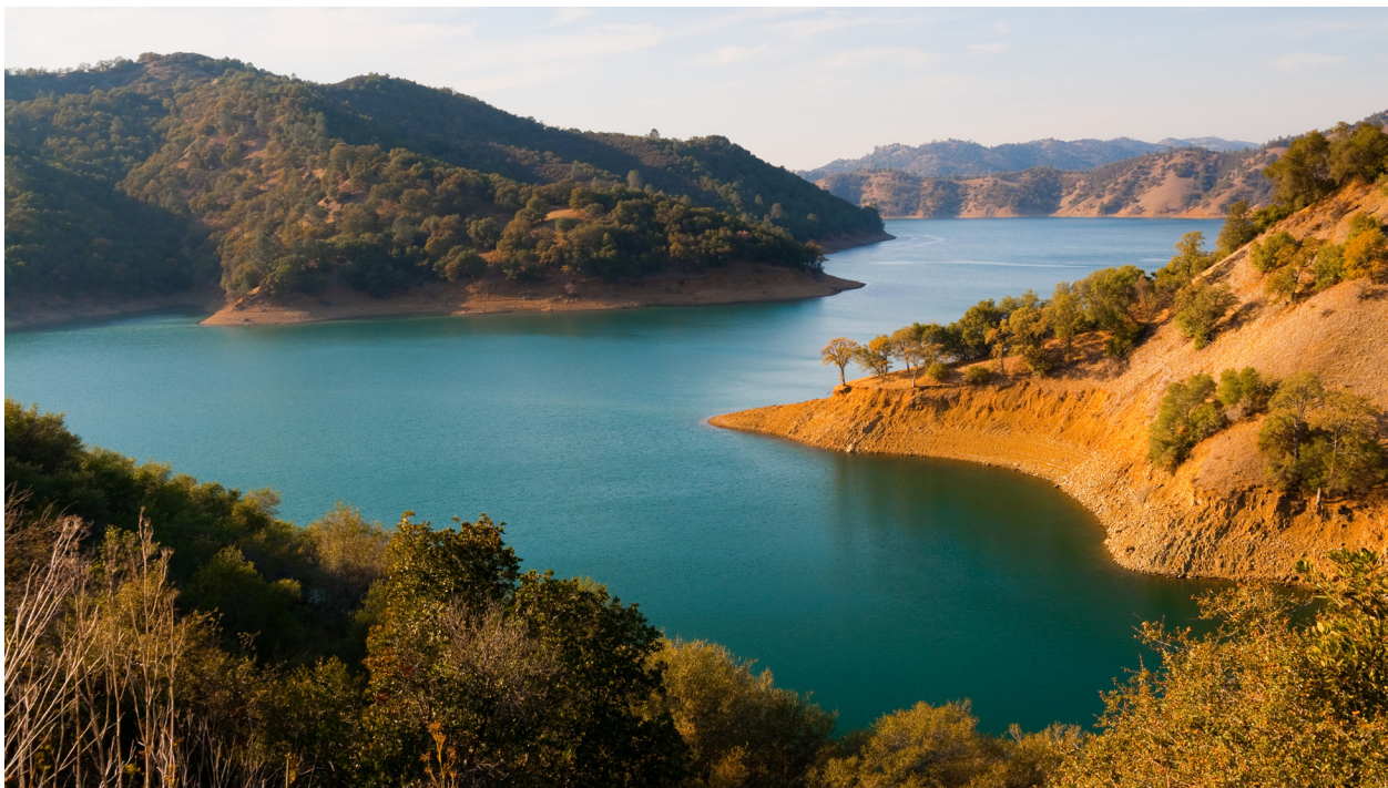
Lake Berryessa near Napa, CA.