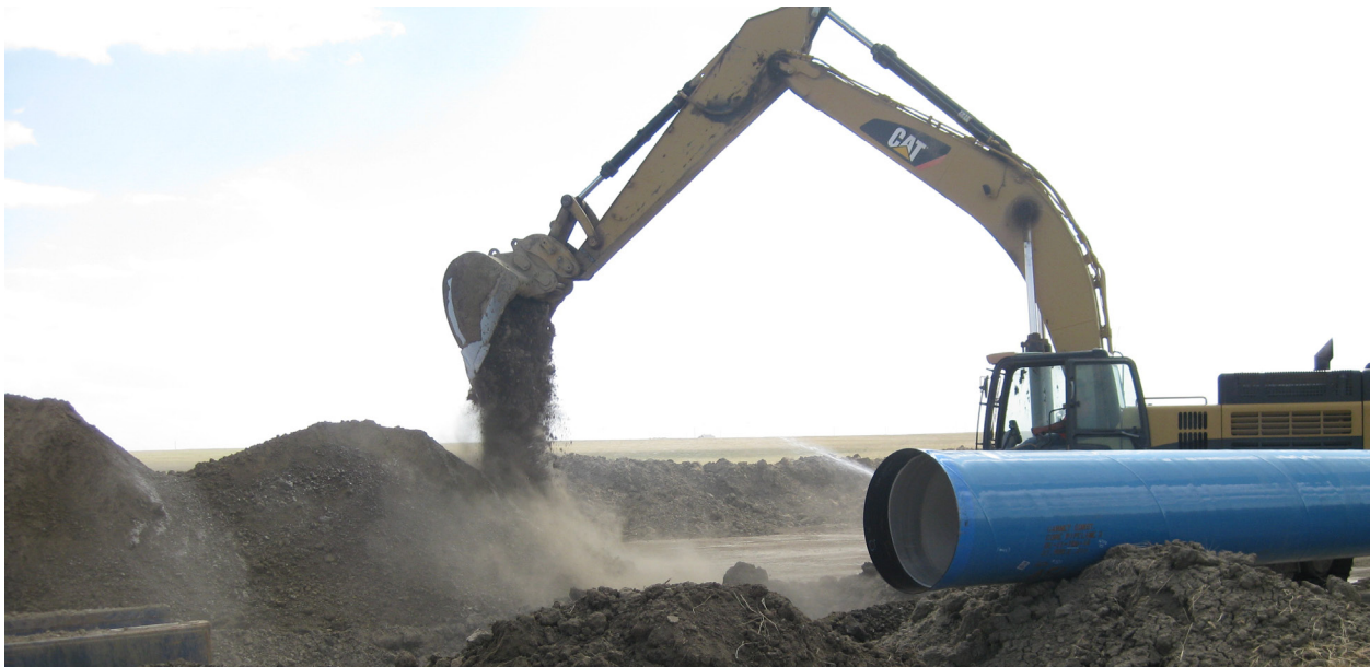
Construction on the Rocky Boy's/North Central Montana Regional Water System.