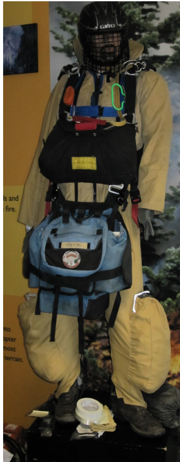
Smokejumpers firefighter uniform.