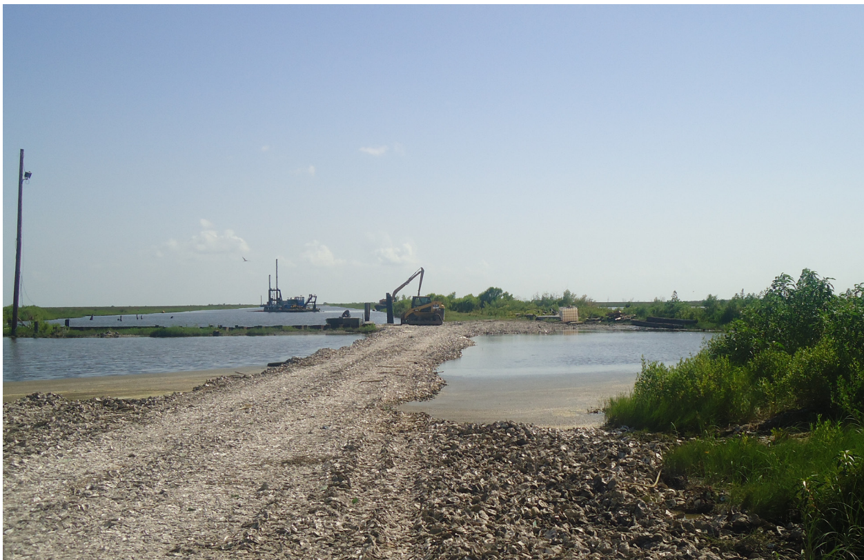
The Fringe Marsh Repair project in Plaquemines Parish will restore approximately 300 acres of wetland area.

The areas of concern we identified in Louisiana include ineffective grant monitoring by FWS, State procurement laws that do not require full and open competition, unallowable costs and mishandled accounting and financial issues, improper acquisitions of real property, ineligible drawdowns, and inappropriate changes in grant scope.