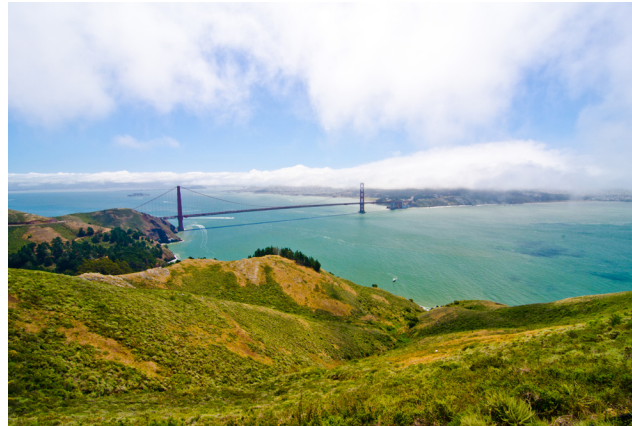
View of the Golden Gate Bridge from Golden Gate National Recreation Area.

In this semiannual report, I am pleased to submit a summary highlighting the Office of Inspector General's dedicated and successful work covering the 6-month period from April 1, 2014, through September 30, 2014. Our audit and investigative work focused on high-priority areas like energy, water, bribery and corruption, and theft of Government funds to promote excellence, integrity, and accountability within the programs, operations, and management of the U.S. Department of the Interior (DOI).