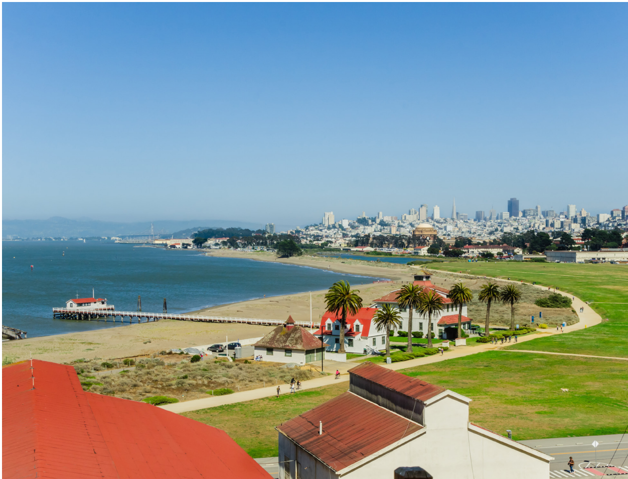
View of the Presidio of San Francisco.

We offered six recommendations to help ensure a continued beneficial relationship between the Trust and USPP. We recommended that NPS change its current practice for funding USPP activities at the Presidio and that USPP update its billing practices. NPS did not agree with our recommendations regarding appropriations law, but it agreed with three of our six recommendations and is working to implement them.