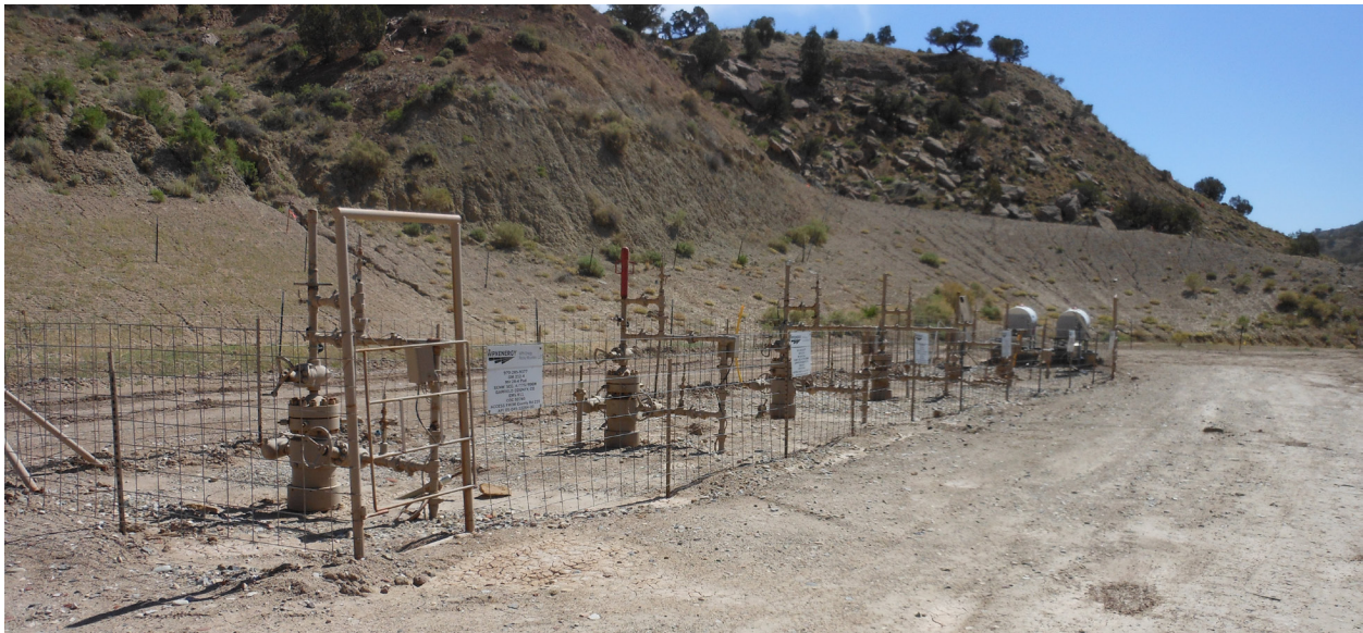
Operational oil wells onsite near Silt, CO.

Until recently, DOI has minimally addressed the APD process with an Instruction Memorandum in 2013, but the memorandum did not go far enough to improve the process significantly. We offered six recommendations focusing on establishing accountability and performance timelines and measures related to the APD process at the field-office level, modifying the oil and gas database to enable accurate and consistent data entry and APD tracking, and implementing best practices to streamline the review process. BLM agreed with five of our six recommendations and has already begun to address our concerns. We believe that full implementation of our recommendations will expedite the review process and facilitate proper development of our domestic energy resources.